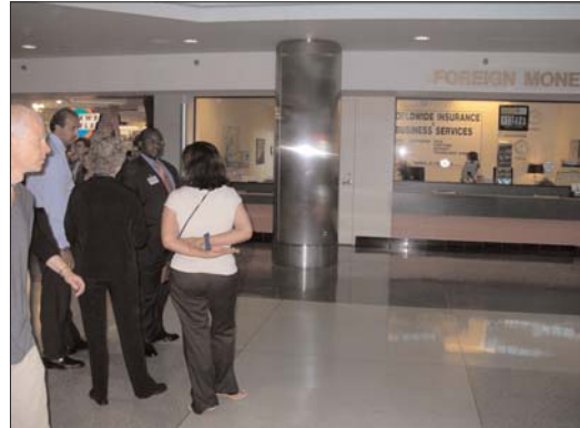
Site tour of an existing space.

With observations and analysis like this in hand the Concessionaire is better prepared to make intelligent, informed decisions and submit a more meaningful RFP response. If you'd like to learn more give us a call. We're here to help.