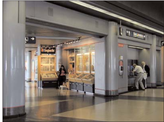
Existing space under consideration

With research like this in hand the Concessionaire is prepared in advance of the Preproposal Conference to make intelligent, informed decisions as to which spaces make the most sense in pursuing. If you'd like to learn more give us a call. We're here to help.