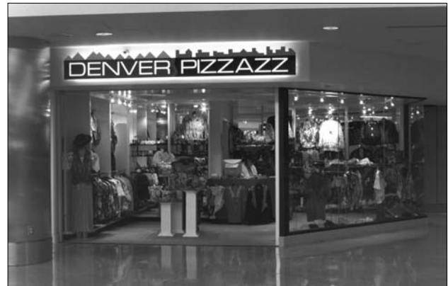
Completed Space - Concourse A Denver International Airport

5080 UTICA STREET POST OFFICE BOX 12207 DENVER, COLORADO 80212 VOICE 303.433.6659 FACSIMILE 303.433.6692 EMAIL rcsad@earthlink.net WEB www.rcsairdesign.com