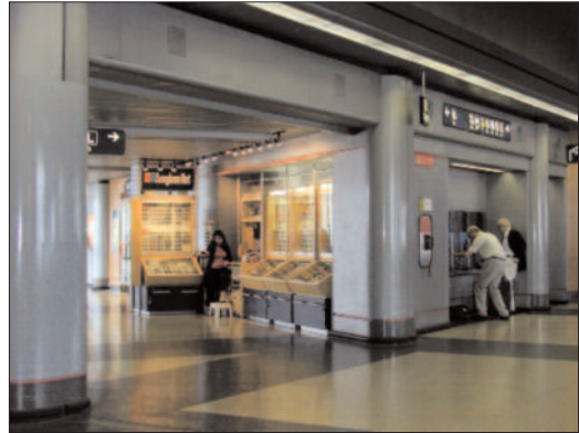
Existing space under consideration

With research like this in hand the Concessionaire is prepared in advance of the Preproposal Conference to make intelligent, informed decisions as to which spaces make the most sense in pursuing. If you'd like to learn more give us a call. We're here to help.