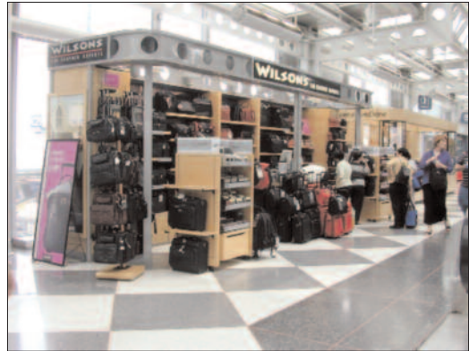
Existing design concept to be revised and utilized